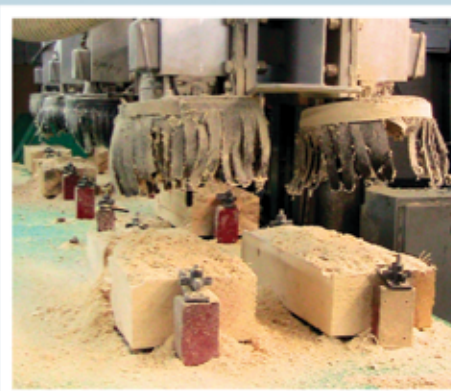
Gang of CNC Controlled Routers