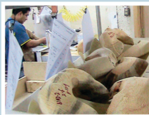
Orders Ready for Assembly

no minimum. Precision is confident enough about their trees to give them a limited, conditional lifetime warranty.