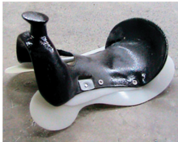
Precision Flex 2 ™

swell, bars, and cantle, with a clear coat of resin. Kevlar® is recommended for ropers and ranch trees.