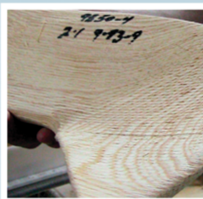
CNC Cut Parts